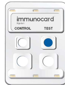
Figure 4. Invalid Result