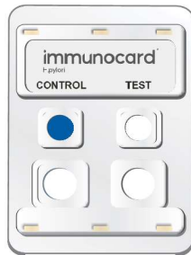
Figure 2. Negative Result