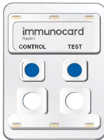
Figure 1. Positive Result