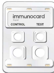
Figure 3. Invalid Result